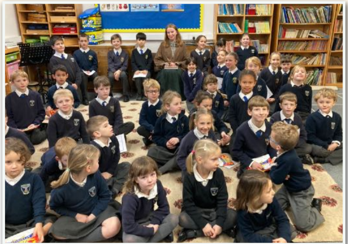
Years 5 and 6's sing carols to local residents with whom they keep in contact via the letter club, to the delight of all involved.