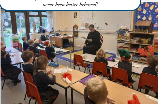
Christmas story time with the Headmaster! The children have never been better behaved!