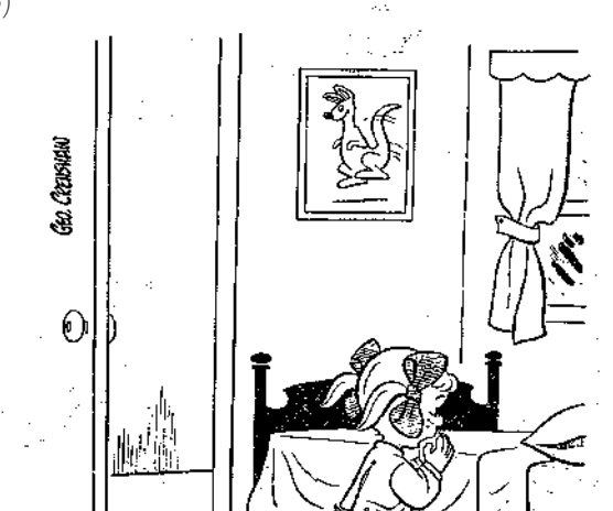
"PLEASE, LORD, TAKE CARE OF MOM, TAKE CARE OF DAD, TAKE CARE OF ME . . . BUT BE SURE TO TAKE CARE OF YOURSELF THE MOST, DEAR LORD, OR WE'RE ALL SUNK!"

"For we preach Christ crucified, to the Jews indeed a stumbling block and to the Gentiles foolishness, but to those who are called, both Jews and Greeks, Christ, the power of God and the wisdom of God." (1 Cor. 1:23)