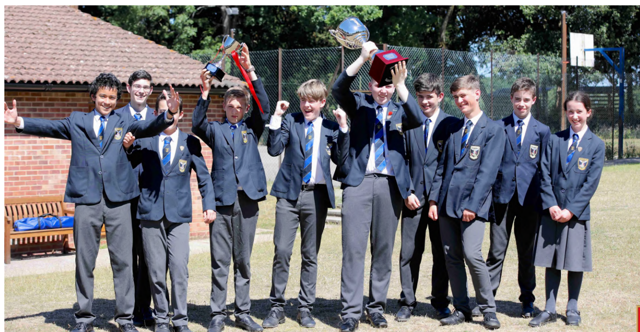
This year's House Winners: BURMA!