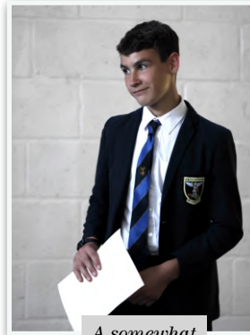
A somewhat stunned "Best Michaellean" winner