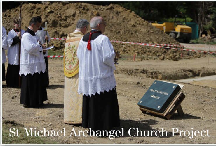
St Michael Archangel Church Project