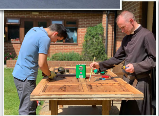
Restoring old doors to new!